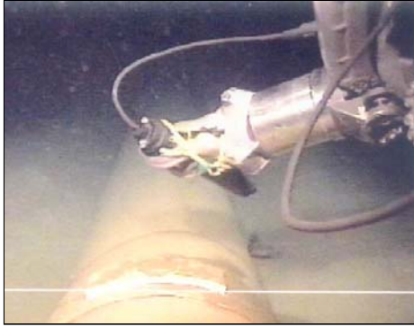
ROV II probe for a pipeline survey