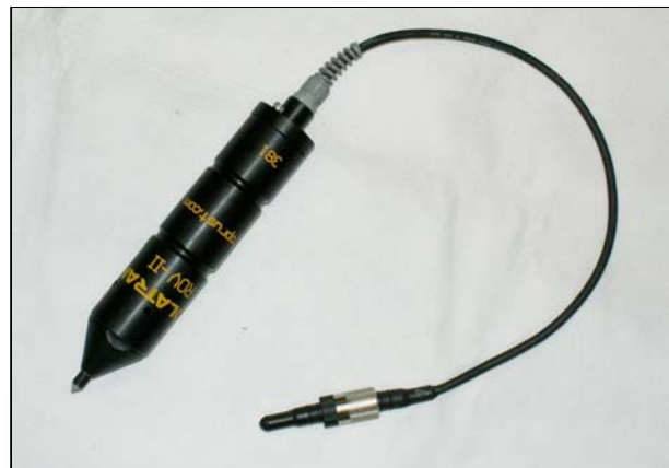
ROV II Probe has dual Ag/AgCl reference electrodes

Deepwater Corrosion Services Inc. 10851 Train Court, Houston, TX 77041 USA Telephone +1 (713) 983-7117 Email sales@stoprust.com www.stoprust.com